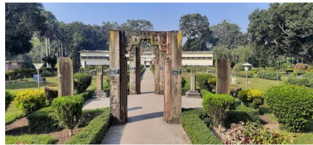
Figure 2. Mahasthangarh Archaeological Museum.

From the month-long fieldwork, an attempt has been made to understand the location of the archaeological sites and their current condition. The study revealed that although locals inhabit next to the ruins of Mahasthangarh; in that case, what is their relationship with the sites- considering this question, the geophysical context has been comprehended by mapping the areas within a radius of four kilometres. During the research, the latitude and longitude data of fifteen sites were collected to understand the distance from one to the other, photographs of those sites were taken, and random interviews were conducted with the locals. As mentioned earlier, Mahasthangarh consists of a massive cluster of archaeological sites, covering two upazilas of the Bogura district, Shibganj and Bogura Sadar. Firstly, our team visited the Mahasthangarh Museum (Fig. 2) and Gobinda Bhita (Fig. 3) to understand the location and the inhabitants adjacent to the sites. Several artefacts bear witness to the past outside the museum; also, inside the museum, there are a significant number of artefacts found at various times during the excavation at Mahasthangarh.