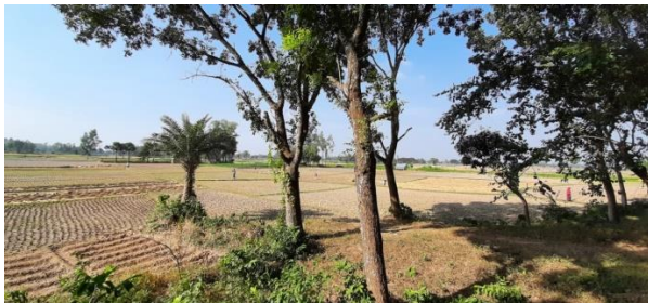
Figure 11. Boiragir Bhita.