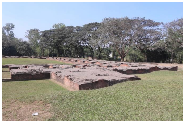
Figure 9. Bihar Dhap.