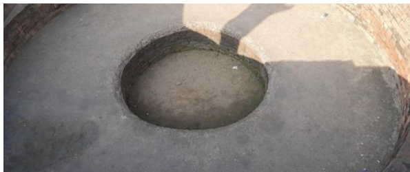
Figure 13. Behular Bashorghor.