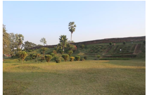
Figure 16. Jahajghata.

The sites of Mahasthangarh are protected by the Department of Archaeology, Bangladesh, although local inhabitants surround most. Some areas have ticketing arrangements for visitors. Bangladesh Parjatan Corporation has a motel for visitors close to the Mahasthangarh Museum. Many visitors visit Mahasthangarh for a picnic; therefore, the authorities have set up a picnic spot at a specific place. Also, there