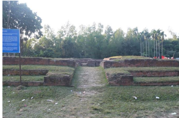
Figure 14. Porshuram Proshad Gate.