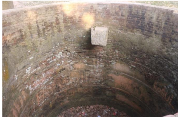
Figure 15. Jiyatkunda.