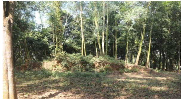
Figure 7. Soura Dighi.

Sur Dighi (Fig. 6), Soura Dighi (Fig. 7) and Kanjer Hari (Fig. 8) are both forested and inhabited by locals. It is difficult to clearly understand the context of the sites because they are covered with plants, although these are protected areas.