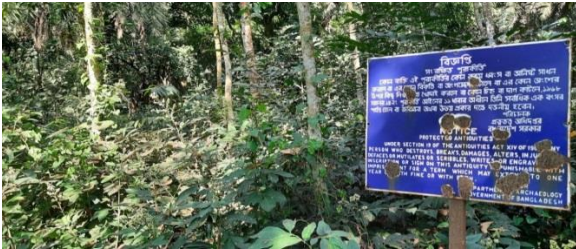
Figure 4. Sekendrabad.

information from those sites. Although the locals do not damage the sites, the problem is the negligence of the staff responsible for taking care of the archaeological site is visible, especially since the Sekendrabad site is entirely forested; however, the signboard of the Department of Archaeology, Bangladesh, is hung in front of the site.