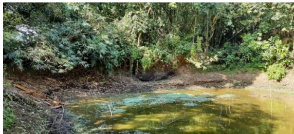
Figure 5. Salimuddi Hajir Pukur.

Northern Black Polished Ware (NBPW) and brick structure visible in the western section of Salimuddi Hajir Pukur (Fig. 5); however, the site has been abandoned and is almost extinct. A local named Salimuddi Haji owns the pond, after whom the place is named. He informed us about getting various archaeological remains while renovating his pond. Also, Salimuddi Haji said that tourists from different parts of the country and even abroad visit this place at different times of the year. But, many visitors cannot see the sites with enough time due to lack of good accommodation facilities. In this regard, our team asked Salimuddi why he does not accommodate tourists in his house- although he hosted visitors many times, he could not accommodate tourists as he needed more rooms to stay overnight, Salimuddi replied.