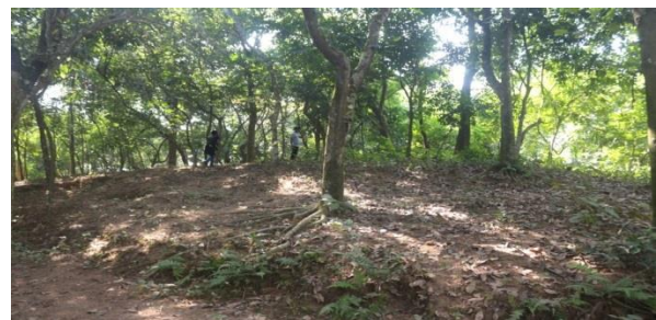
Figure 8. Kanjer Hari.

Among the sites of Mahasthangarh are Bihar Dhap (Fig. 9), Bhashu Bihar (Fig. 10), Gokul Medh (Fig. 12), Behular Bashorghor (Fig. 13), Porshuram Proshad Gate (Fig. 14), Jiyatkunda (Fig. 15) and Jahajghata (Fig. 16) is in somewhat better condition. However, the shape of Boiragir Bhita (Fig. 11) is quite deplorable, and several sites also have piles of garbage. Hence, ample opportunity exists to present them more attractively to the tourists.