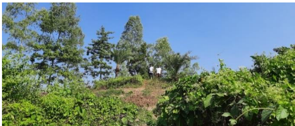
Figure 6. Sur Dighi.

Northern Black Polished Ware (NBPW) and brick structure visible in the western section of Salimuddi Hajir Pukur (Fig. 5); however, the site has been abandoned and is almost extinct. A local named Salimuddi Haji owns the pond, after whom the place is named. He informed us about getting various archaeological remains while renovating his pond. Also, Salimuddi Haji said that tourists from different parts of the country and even abroad visit this place at different times of the year. But, many visitors cannot see the sites with enough time due to lack of good accommodation facilities. In this regard, our team asked Salimuddi why he does not accommodate tourists in his house- although he hosted visitors many times, he could not accommodate tourists as he needed more rooms to stay overnight, Salimuddi replied.