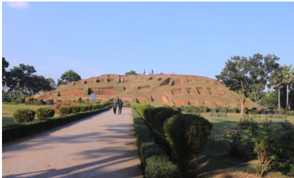
Figure 12. Gokul Medh.