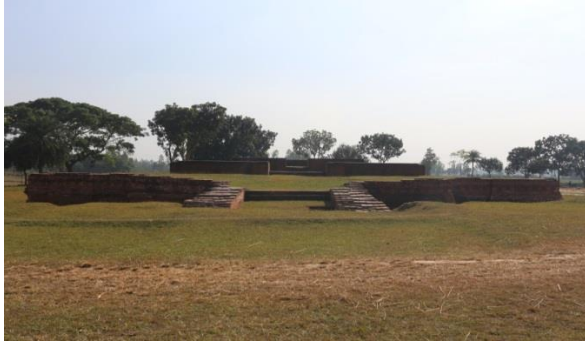
Figure 10. Bhashu Bihar.

The locals are undoubtedly one of the most important stakeholders of the sites; having lived near the sites for a long time, they know a lot of information about the periphery. It is not impossible to take the initiative to effectively apply the concept of homestay tourism by giving them adequate training and proper facilities [18].