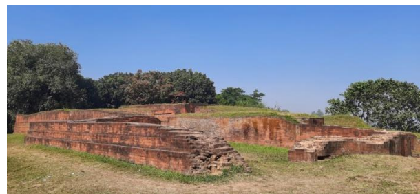
Figure 3. Gobinda Bhita.

Later, the research team visited Sekendrabad (Fig. 4) and Salimuddi Hajir Pukur (Fig. 5) and collected